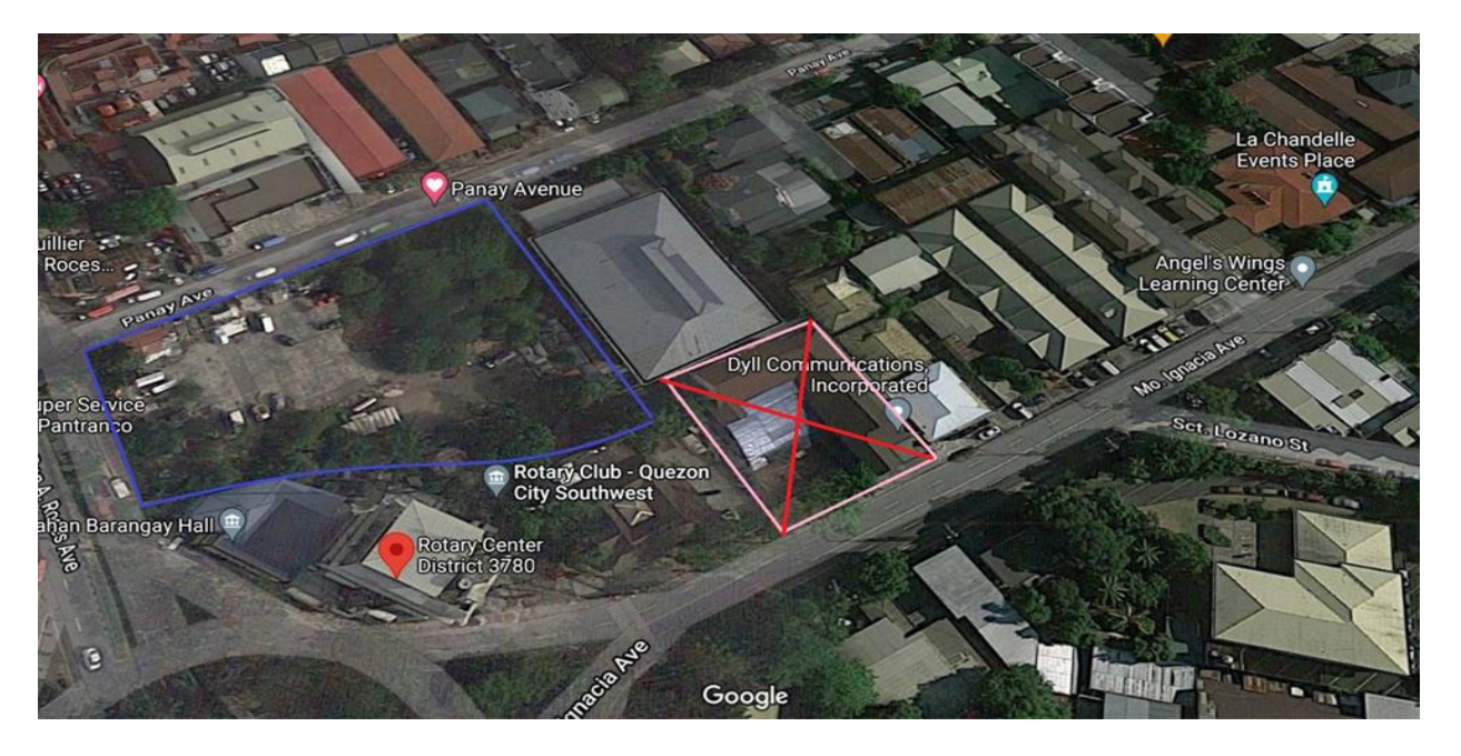
Property in blue is the original 4,531 square meter GVMC lot. Property in pink with a red X was the second property being purchased which is now no longer available.

Be that as it may, we had laid out a sound plan for GVMC prior to the lot becoming available. And while annexing this property into our corporation would have added flexibility in achieving our goals of becoming the premier specialty center in Quezon City, we will simply revert to our original plan.